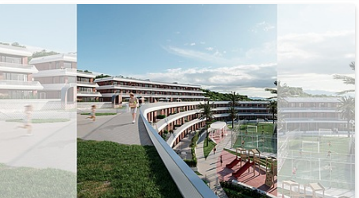
2 and 3 bedroom properties with large communal areas located in La Cala de Mijas